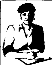
Medical Care for Victims of Domestic Abuse